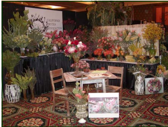
Fun N Sun Booth

It's hard to believe Summer has come and gone. We do enjoy those long, warm Summer days but at the same time look forward to the Holiday Season and the onset of flower season! Summer, 2004 brought creativity and competition to Resendiz Brothers.