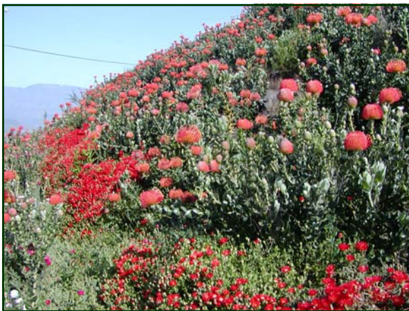
A field of Flame Giants

The fields were beautiful during the Spring