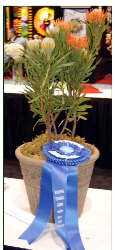
Prize Winning Pincushion Plant

venue to meet with many of you – who we speak to week after week - to put a face with a name! It also provide us the chance to show customers the full range of flowers and foliage we offer, to educated them on the items they cur-