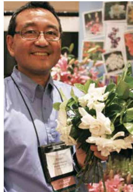
Long-lasting (five to seven days) stemmed gardenias from Kitayama Brothers, www.kitayamabrothers.com