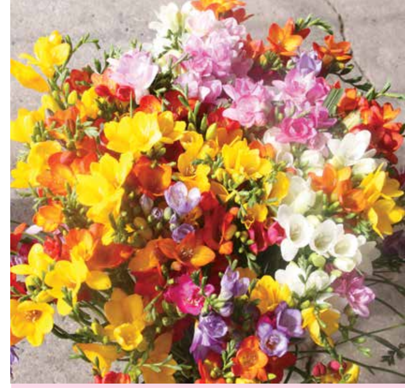
At Holland America, farm visitors could watch as workers in hoop houses harvested freesia, then bundled, recut, and sleeved the flowers on the spot and quickly placed the bunches in buckets for transfer to the processing area. Buckets of fully open freesia were also on display.