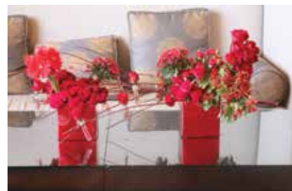
A team of seven AIFD designers kept the lobby of the convention hotel overflowing with inventive designs to showcase California’s fresh flowers.