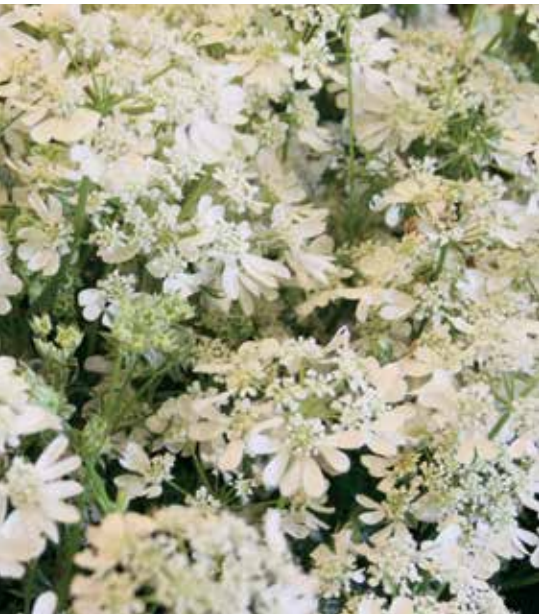
Orlaya from Dramm & Echter, www.drammechter.com