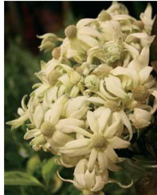
Flannel flowers, still rare on the market, from the California Protea Association, www.californiaprotea.org