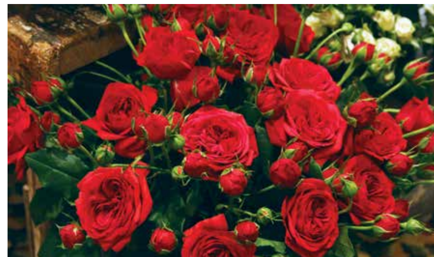
'Francois Rabelais', a ravishing red rose from California Pajarosa Floral, www.pajarosa.com