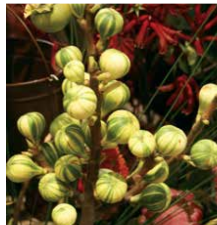
Immature striped figs—they would normally be harvested a little later in the season—from the California Protea Association, www.californiaprotea.org