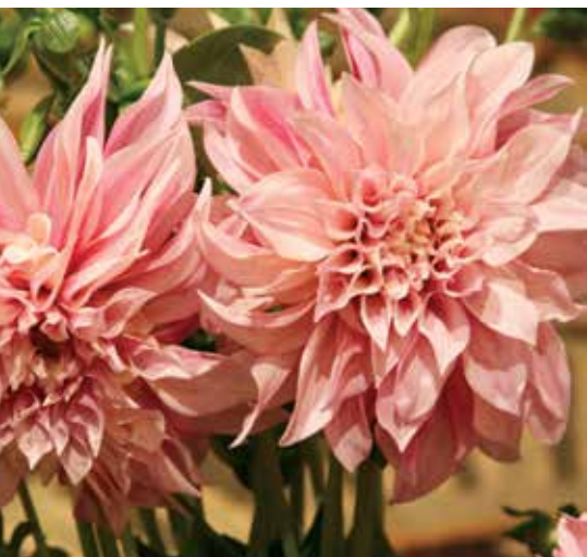
Dahlias from Skyline Flower Growers & Shippers, www.skylineflowers.com