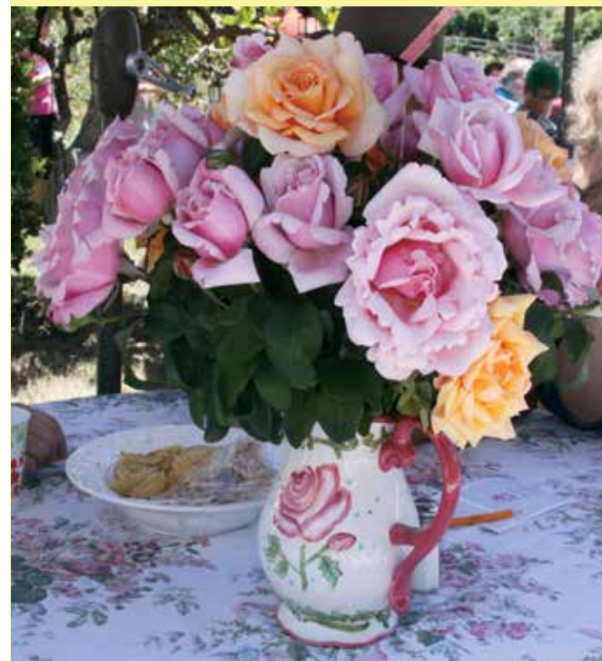
At Rose Story Farm, Danielle Hahn grows garden roses that are picked to order for special-event clients. Visitors on the first day of tours were treated to lunch at the farm, with fragrant rose bouquets on the tables. When you smell a rose, Danielle suggests, take at least five seconds to fully appreciate its perfume.