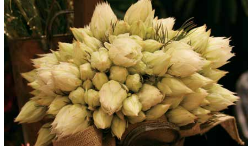
Blushing bride proteas from the California Protea Association, www.californiaprotea.org