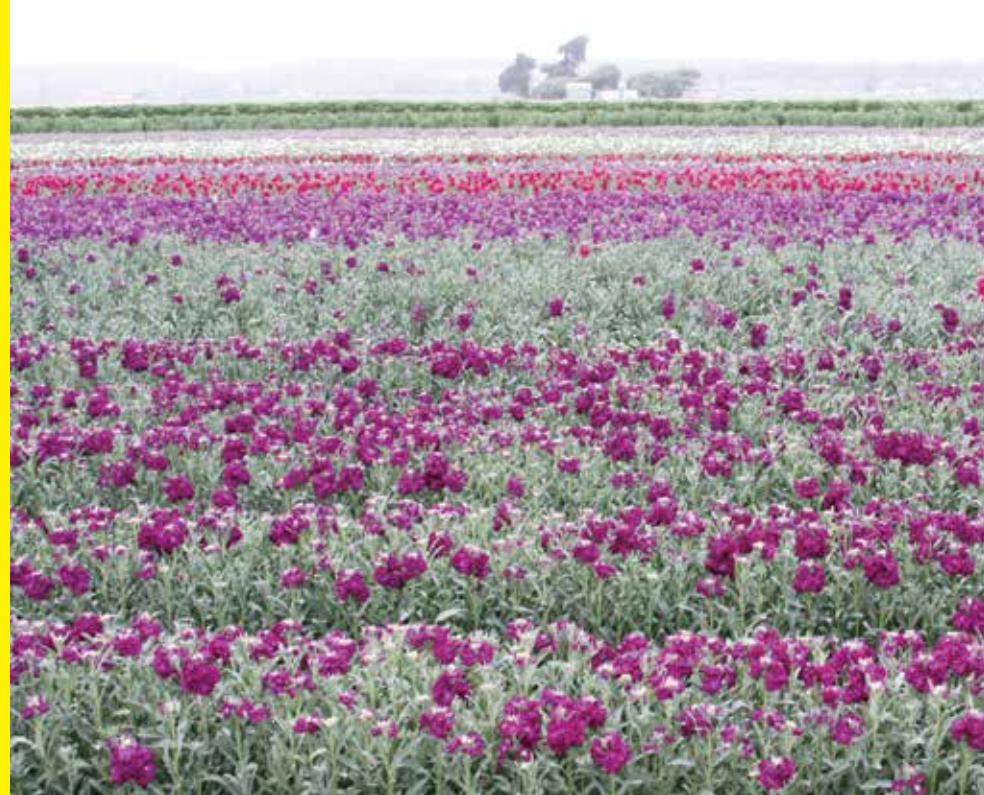
Over two days of optional farm tours, convention participants could visit eight flower farms, all within driving distance of Santa Barbara, where this year's convention was held. The second day of tours ended with lunch in a tent erected right in the middle of flower fields, blooming with sunflowers and stock, at Ocean View Flowers in Lompoc, California.