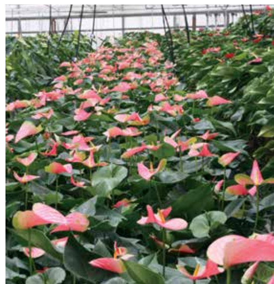
While most anthuriums on the market are field grown and come from Hawaii, California grower Ever-Bloom—best known as a gerbera farm—also grows anthuriums in greenhouses. They are a little more expensive, but of reliably consistent quality.