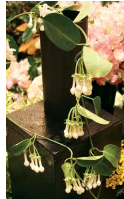
Stephanotis on the vine, from California Flower Shippers, www.californiaflowerhippersinc.com