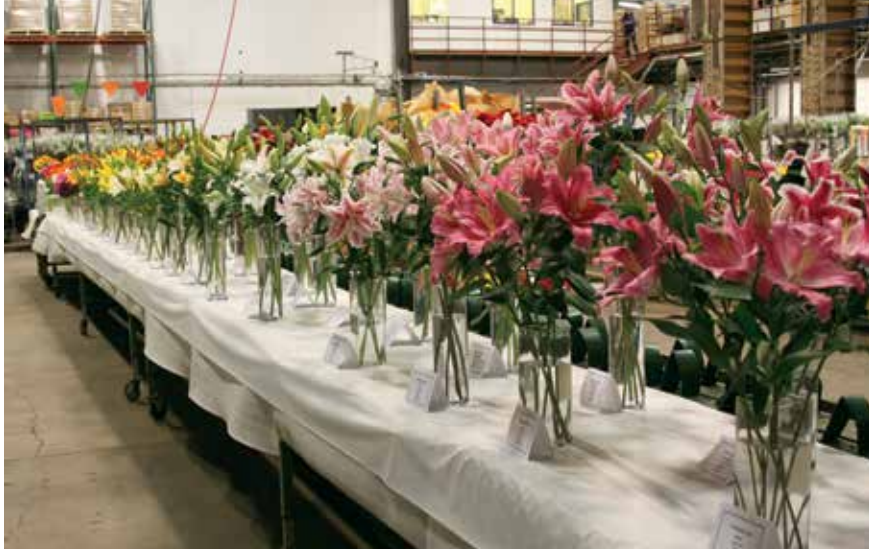
Dozens of varieties were on display at Sun Valley Floral Farms, at its Oxnard facility—not only lilies, as seen here on the near end of the table, but sunflowers, asters, iris, matricaria, lisianthus, gerberas, and more.

“With stories like these,” says Lane, “the potential is there to grow the market by promoting American-grown flowers. I see great opportunity for flowers in this country—but it’s going to take all of us to get there.” 🌱