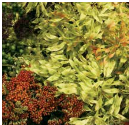
Pistachio-colored queen of hearts, a forged product available in late June and July from California Flower Shippers, representing small boutique growers in the Pescadero area, www.californiaflowerhippersinc.com