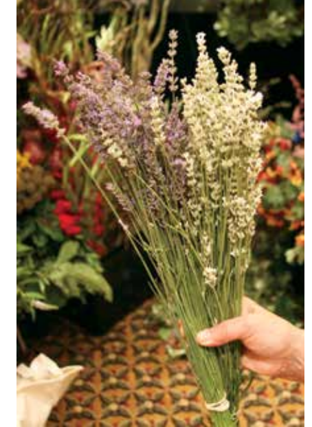
White English lavender, somewhat less fragrant than purple lavender, available May through July from California Flower Shippers, www.californiaflowerhippersinc.com