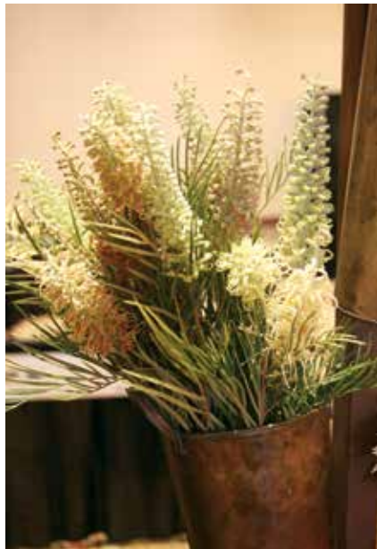
Grevillea from California Protea Association, www.californiaprotea.org