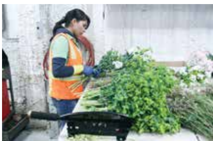
Ocean View Flowers is one of few flower farms where packing is done entirely in refrigerated rooms. Cuts go into a bucket in the field and are sleeved immediately, then conditioned in a cool (but not refrigerated) receiving area, to prevent moisture from collecting inside the sleeve. Finally, they are moved into a large cooler for packing. Ocean View is credited with introducing bupleurum (seen here) to the market.