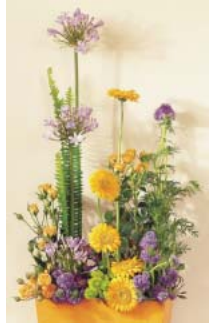
Colors explode with mango-orange mini Gerbera, tangerine spray roses, periwinkle blue Gillia and Agapanthus, 'Kermit' Chrysanthemums and sword fern.

The mini Gerbera can be dressed down for casual occasions, or dressed up for